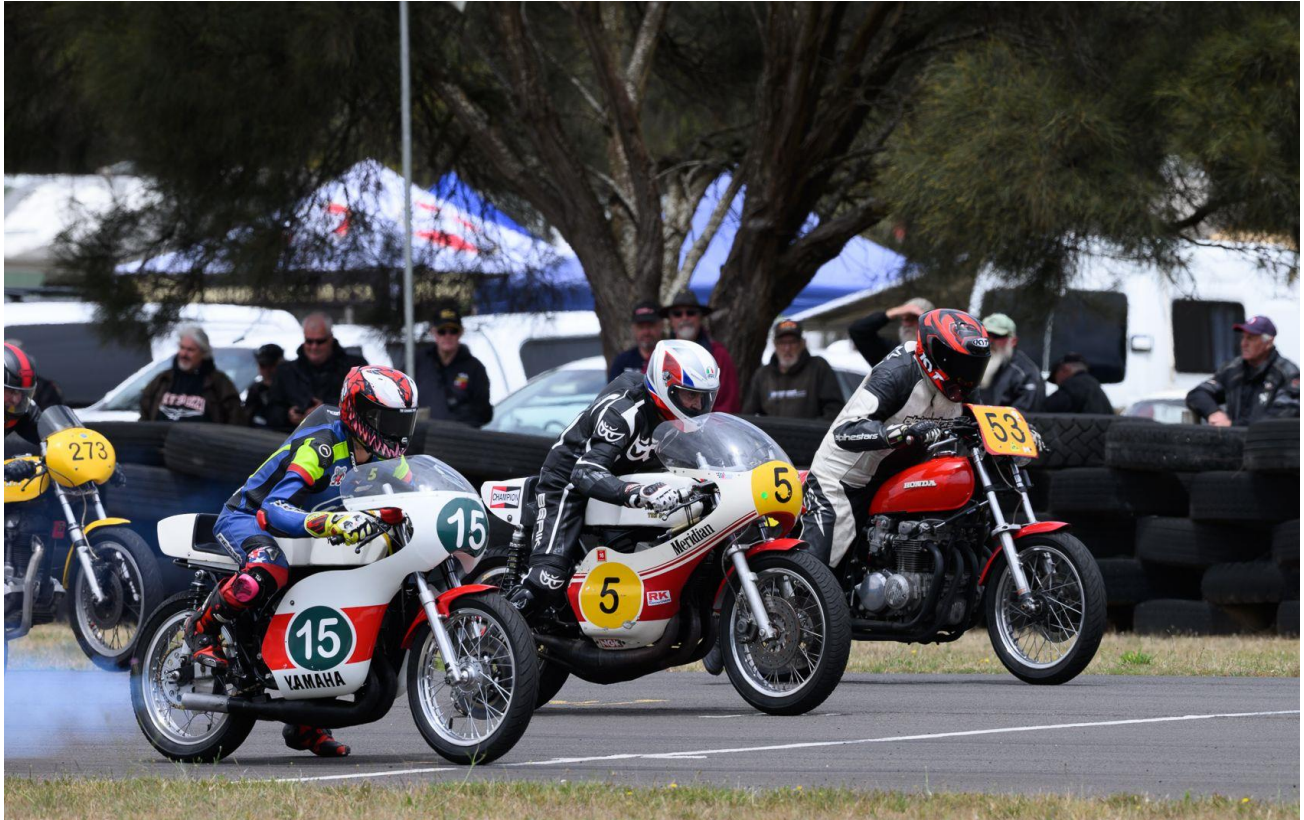
Front Row of the Grid