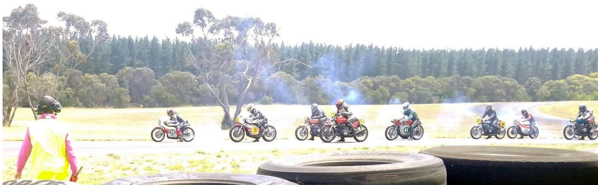
The Grid (top)