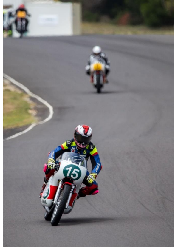
Leading towards the first corner