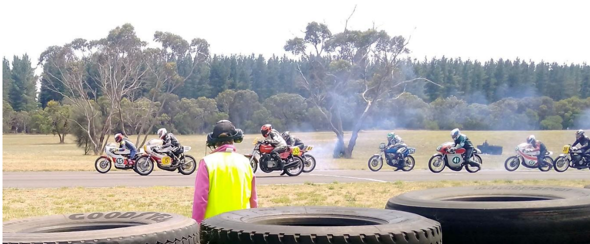
Let's go Racing (bottom)